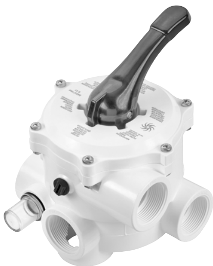
^ BADU Mat R 41