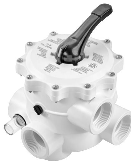
^ BADU Mat R 51