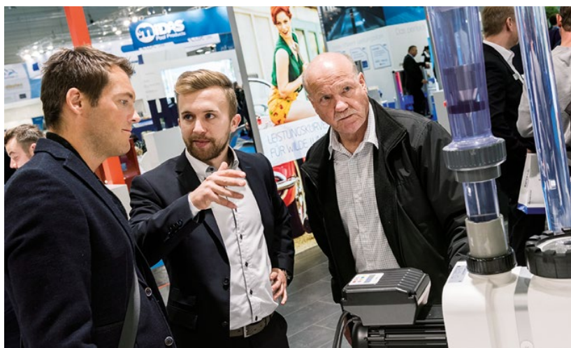
New BADU products in focus at the Aquanale.