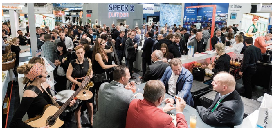
The SPECK trade fair party - a highlight at the Aquanale in Cologne.