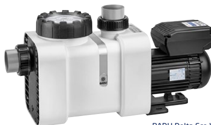
BADU Delta Eco VS.

BADU Gamma Eco VS offers additional, efficient energy saving due to a permanent magnet motor which can be controlled easily via a motor display.