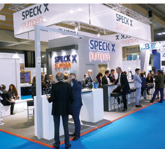
SPECK Pumpen trade fair stand in Barcelona 2017.

SPECK Pumpen was represented at all the swimming pool technology international trade events.