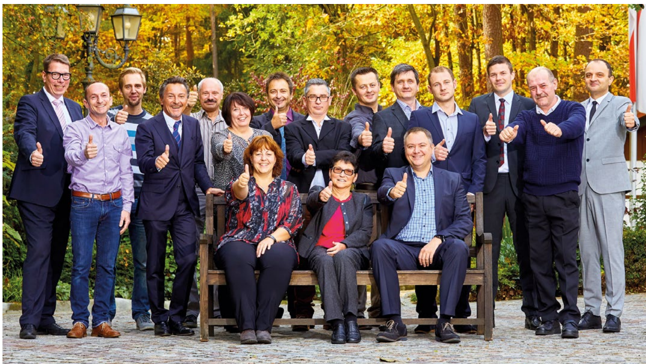
Our anniversary employees and those congratulated by the Managing Directors at the 2017 anniversary party.