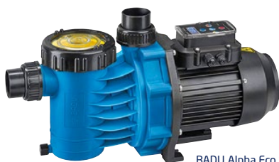
BADU Alpha Eco Soft.

At the autumn trade fairs SPECK Pumpen presented three new swimming pool pump ranges with low power consumption, optimum grades of efficiency and extremely smooth running; two remodelled counter swim units with piezo buttons for ultra simple touch control; and an automatic backwash unit that flexibly replaces all existing devices.